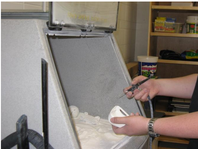
After carefully removing the part from the printer, the extra powder is then blown off and eventually recycled.