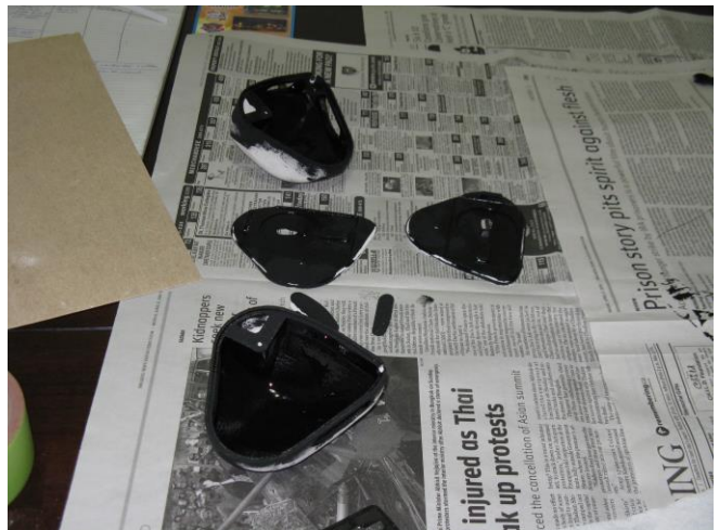
The part then needs to be hardened. For this project I chose to use a paint called "POR-15". It is a rust prevention paint which dries as hard as a rock.