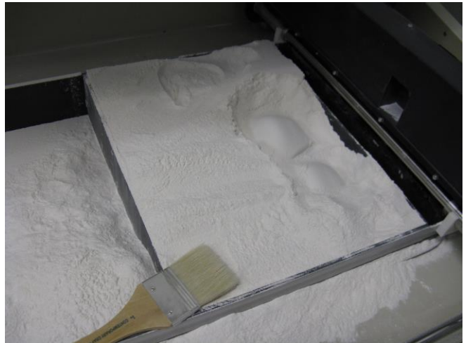
You get the pieces out by pressing a button which raises the pile of powder and then brush off what you don't need, but just enough to get your part out.