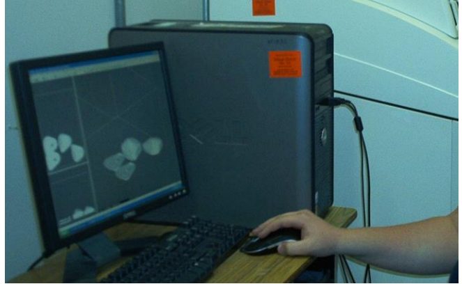
The part is then imported into a program which allows you to rearrange where exactly the part will end up in the printer.